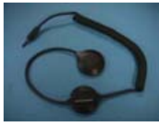
D – Headset