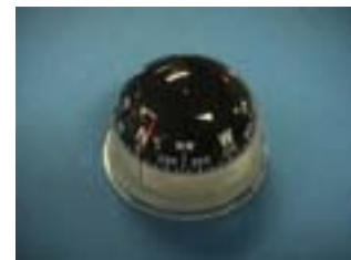
I – Compass