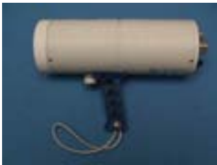
A – Sonar Unit

The components of the Sonar Set are shown in Figure 2 and described in this section.