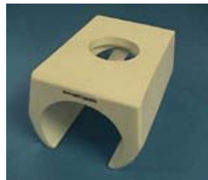
H – Flotation Collar