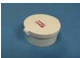
C – O-Ring Lubricant