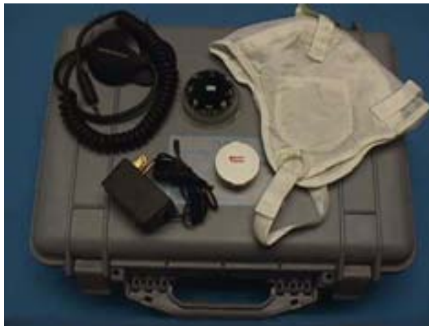
Figure 5 - Sonar Set Accessories