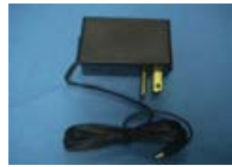
G – Battery Charger