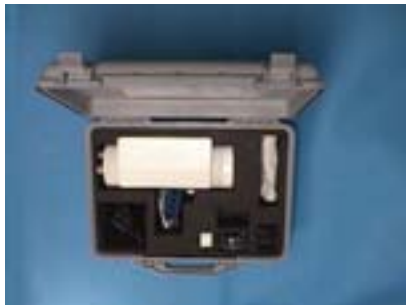
B – Carrying Case