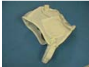
E – Skull Cap