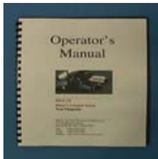
F – Operator's Manual