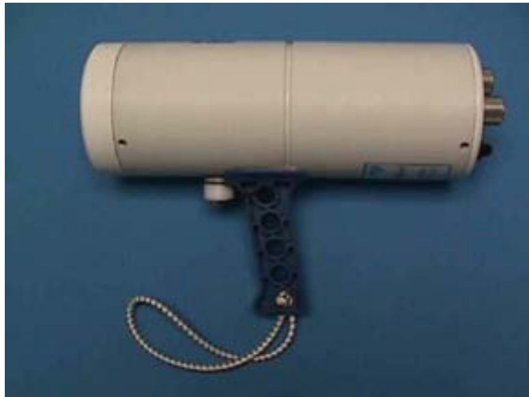
Figure 1 – Sonar Unit

Read this manual to familiarize yourself with the proper use and operation of the sonar unit. Note: Maintenance of the unit by the customer should be limited to outer case cleaning and battery charging, whenever possible.