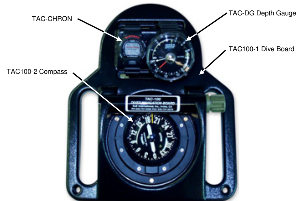
TAC-100-A Dive Navigation Board

The TAC-100A allows the diver to monitor depth, direction and leg time. By using this information, a diver can plot and follow a planned course during a dive with a high level of reliability.