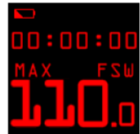
DIVE MODE MAX DEPTH ACTIVATED